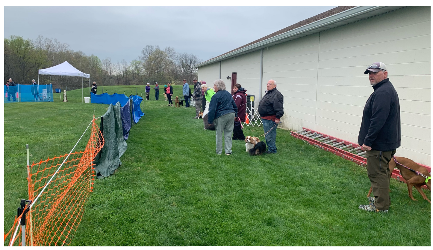
Ready to Run